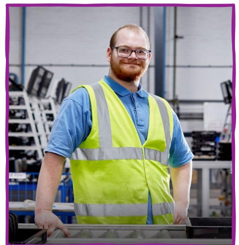
JJ BT, MtW Youth Ambassador

There are also a number of additional considerations that will not only support a successful application but also guarantee a quality placement for your Kickstart placements.