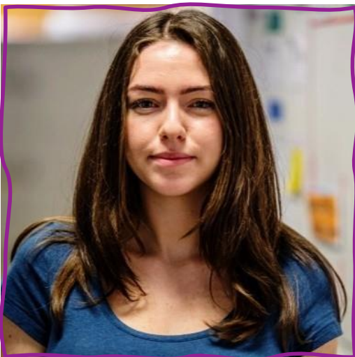
Broch Civil Service, MtW Youth Ambassador

You should interview any potential partners to check for evidence of previous success in supporting young people at work.